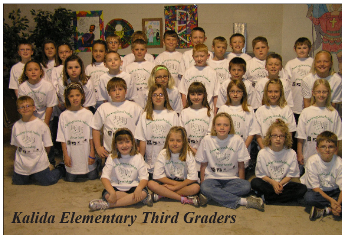
Kalida Elementary Third Graders