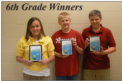
6th Grade Winners